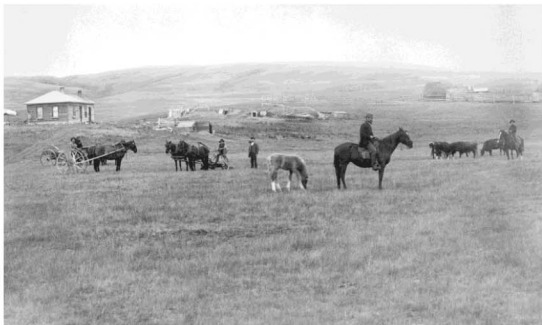
William Bruce Farm, 1894 Brentwood Shopping Centre was built here in 1963.

Meet: Central United Church, 131 - 7 Avenue SW