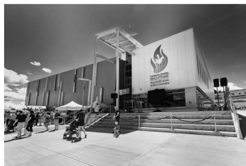
Canada's Sports Hall of Fame