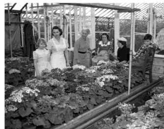
Red Cross Crippled Children's Hospital Spring Tea at Terrill's Greenhouses March 1954

Please see page 5, July 26, for complete details.