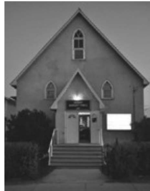
Calgary Buddhist Temple

Meet: Calgary Buddhist Temple, 207 - 6 Street NE