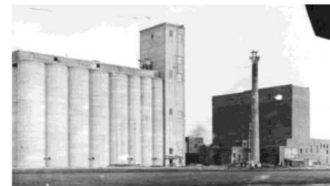
Grain elevator, Calgary, n.d. Glenbow Archives ND-8-303

Meet: Memorial Park Library, 1221 - 2 Street SW