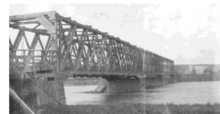
Langevin Bridge, n.d.

Meet: Heritage Park, 1900 Heritage Drive SW, in the Engineered Air Plaza of Heritage Town Square outside the Gasoline Alley building entrance