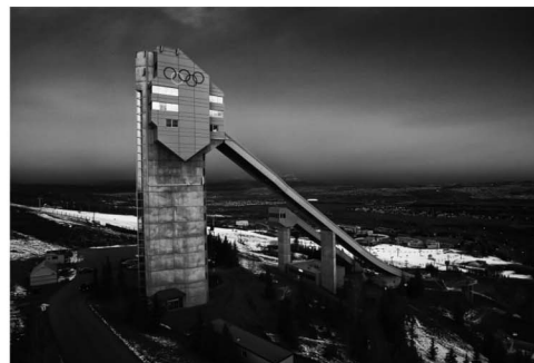
90 metre ski jump tower

Repeat of Sunday, July 28 at 2:00 pm. See page 9 for details.