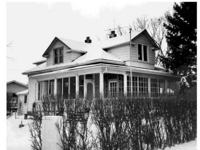
Boyhood home of Joe Clark, High River