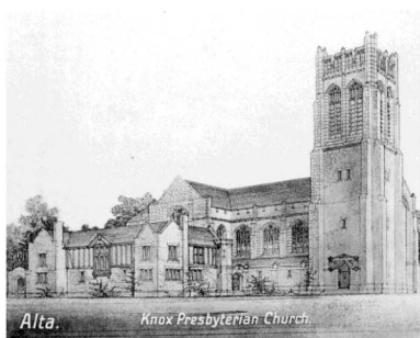
Architect's sketch of Knox Presbyterian Church, ca. 1912 (now Knox United Church) Glenbow Archives PD-322-24d

Meet: 28 Avenue and Spiller Road SE at the Galloway House on the east side of Union Cemetery