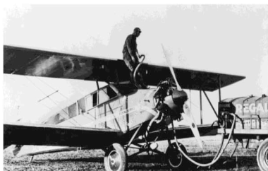
Fuelling Stinson Detroiter, ca. 1928 Freddy McCall flew nitroglycerine in this plane.

Meet: Fort Calgary Historic Park, Burnswest Theatre, 750 - 9 Avenue SE